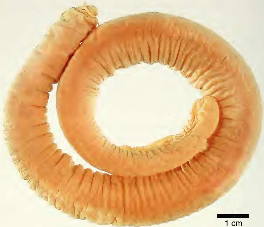
FIGURE 1. Dorsal view of preserved holotype of Eptatretus lakeside (CAS 201880; 275 mm TL).

ETYMOLOGY. — Named lakeside , a noun in apposition. We take great pleasure in honoring the Lakeside Foundation of California, which has generously supported the work of the senior author and many other foreign scholars.